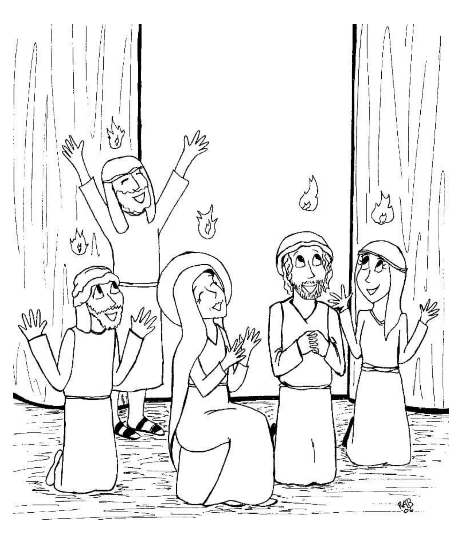
Acts chapter 2,verses 1 – 21 ... they were all together in one place ... Suddenly a sound of a violent wind came from heaven .... they saw what seemed to be tongues of fire that separated and came to rest on each of them.