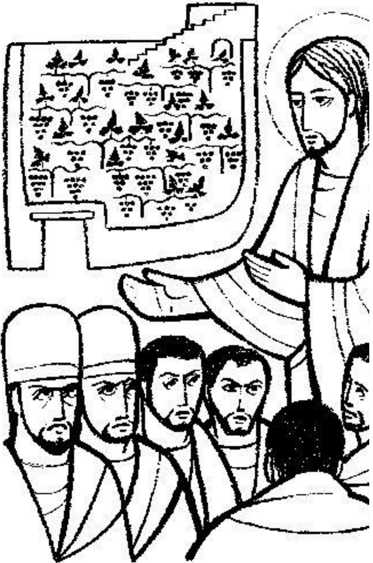
Matthew 21, verses 33-46, Jesus told another parable and the chief priests and Pharisees heard him.