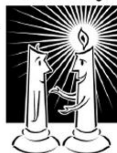
Jesus Is the Light

G O A F Z A H G S G O D Z L I W E W D K A A S R A F L Z P J N O E Z I J E P Z Q H N S G K U O R S Z N O P K K W Y G F J P A S L T X Q H K G R M A N G V E N I D M G C N L I G H T H M W W M G O M V B J R K C K M R P G E Z C S V R B Z V M B M V B Q N F B O Y R N V I K E L S O G F N J F B Z A E X C L A R T I R H I H P Y M N R S I N D R K C T W V B J E B Z E E L X U N S E T Y A R C A B N V A R E E J T P R O P H E T T E B L T M J N R N I P T I X A D T