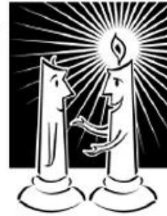
Jesus Is the Light